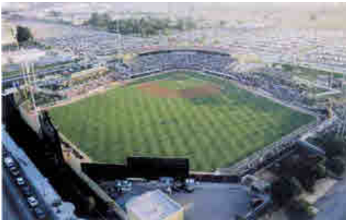
Home of the Inland Empire 66ers Professional Baseball Club, an affiliate of the Seattle Mariners

The quality of life in San Bernardino blends old traditions with new concepts and community involvement. San Bernardino is the location of the nation's original McDonald's Restaurant site , the cars and stars of the award winning annual Route 66 Rendezvous® classic car event , the Area Youth Sports Alliance for regional, national and international tournament sports, Sturges Center Theater and Junior University for youth performing arts and the International Children's Choir.