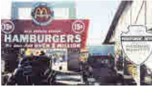
First McDonald's Restaurant Site

Rt. 66 - Don't miss the curious Wigwam Motel on the north side of Foothill Boulevard, one of the remaining relics of the 66 era. San Bernardino was made quite famous by all of the excitement of the "Mother Road." The Route still exists and passes through the city on its way to Santa Monica where it ends.