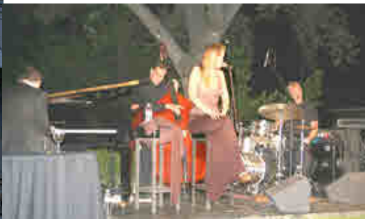
Jazz at the House

This popular jazz concert series, now in its 3rd year, continues at Historic Greystone Mansion.