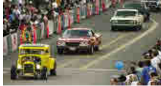
Route 66 Night Cruise