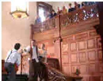
The Manor Murder and Mystery in the Mansion

This popular jazz concert series, now in its 3rd year, continues at Historic Greystone Mansion.