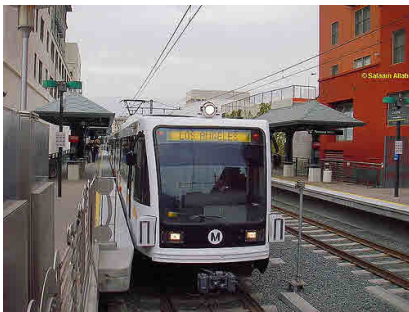
Car 231 Del Mar Station Pasadena Ca

Beyond the excitement of the Annual Rose Bowl Parade and football game, Pasadena, California is also a Route 66 adventure.