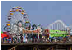
New Ferris wheel on the Santa Monica Pier

Golden beaches and a sultry Pacific Ocean coastline, urban walkways and sandy terrain, gourmet cuisine and world-class dining, and first-rate couture and upscale boutiques.