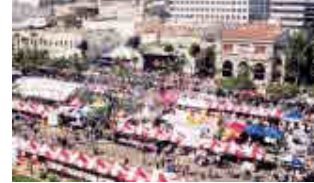
Court Street Square

The quality of life in San Bernardino blends old traditions with new concepts and community involvement. San Bernardino is the location of the nation's original McDonald's Restaurant site , the cars and stars of the award winning annual Route 66 Rendezvous® classic car event , the Area Youth Sports Alliance for regional, national and international tournament sports, Sturges Center Theater and Junior University for youth performing arts and the International Children's Choir.