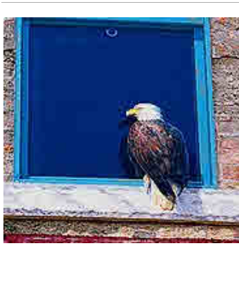
The 'bird' looking into the illusion which itself is an illusion could be symbol for Americana or even a

Located along historic route 66, Winslow Arizona has built a Park dedicated to that famous Eagle's song 'Take it Easy'. The Trompe L'oeil "windows" that are secured to the brick facade of the hotel conjure up reflections of that immortal moment when "a girl, my lord, in a flat bed Ford slows down to take a look at me." For more on the park itself visit the web site; Take it easy in Winslow, Arizona.