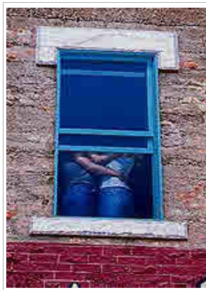
In the middle of the day?