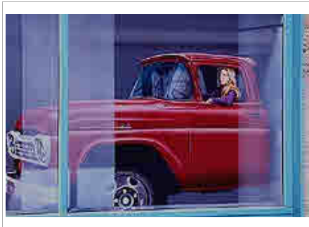
Detail of lower left window. (JPG, 66K)

Located along historic route 66, Winslow Arizona has built a Park dedicated to that famous Eagle's song 'Take it Easy'. The Trompe L'oeil "windows" that are secured to the brick facade of the hotel conjure up reflections of that immortal moment when "a girl, my lord, in a flat bed Ford slows down to take a look at me." For more on the park itself visit the web site; Take it easy in Winslow, Arizona.