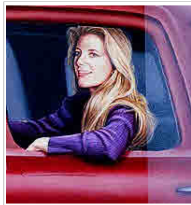
Good thing she's slowin' down, she's looking right at me. (JPG, 45K)